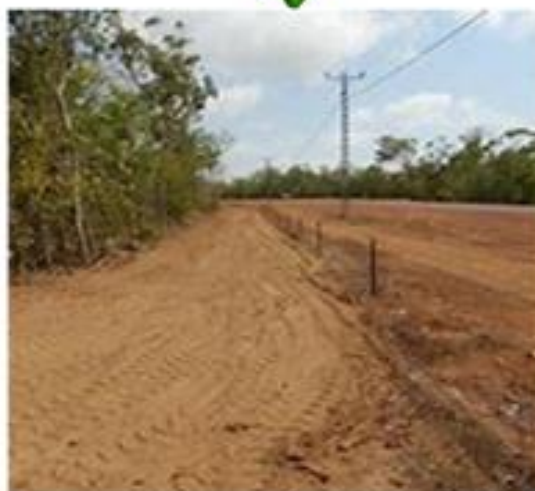
Picture: Example of required firebreak and dimension of fire units