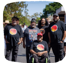
The Red Ochre Band