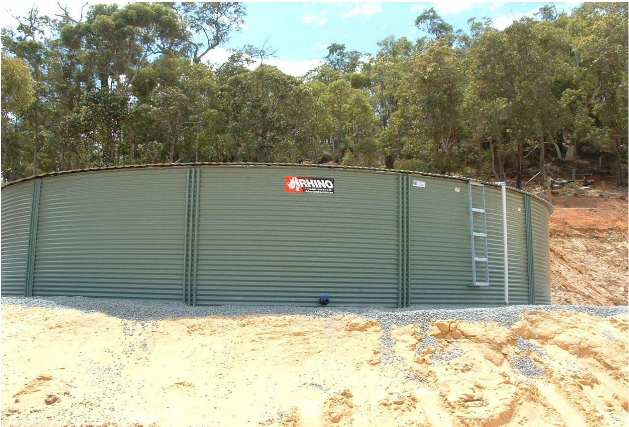
Figure 1: Photo of Rhino water tank as example of type of commercial tank being supplied, for illustration purposes only and not indicative of correct sizing of RCT-200-22 Corrugated Colorbond Commercial Tank.