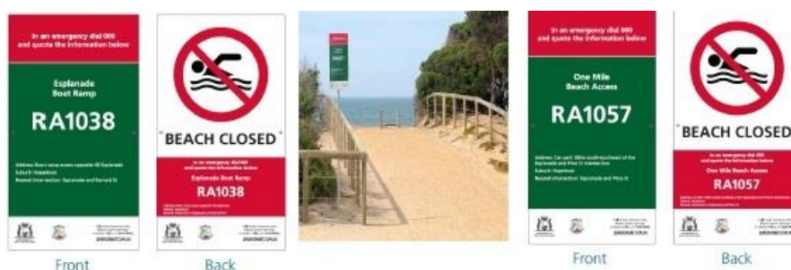
Figure 3 – BEN Signs front and Back as installed in Ravensthorpe

closure alert on the back so staff can quickly close beaches in the event of emergencies. As depicted in Figure 3 – BEN Signs front and Back as installed in Ravensthorpe