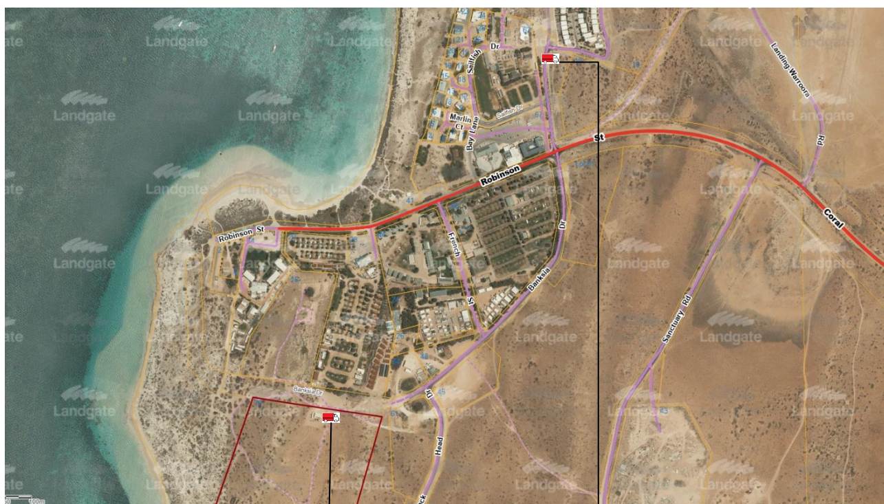
Figure 1. Location Plan

The applicant is seeking approval to use the expandable trailer van used for the Australia Post/Lotterywest licence at the northern end of Banksia Drive, see Figure 1. The hours of operation sought are from 1:00pm until 5:00pm Monday to Friday. Mobile trading licences can be issued for a maximum period of 12 months.