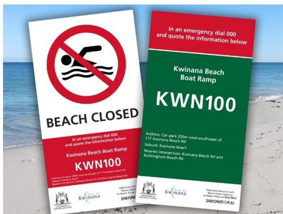
Figure 1 Beach Emergency Numbers (BEN) system

The Western Australian Government is committed to keeping the community as safe as possible when using our oceans. There is no one simple solution, shark encounters are rare and shark safety initiatives, operational responses and shark safety tips, allow the community to keep informed and help reduce the risk of a shark encounter.