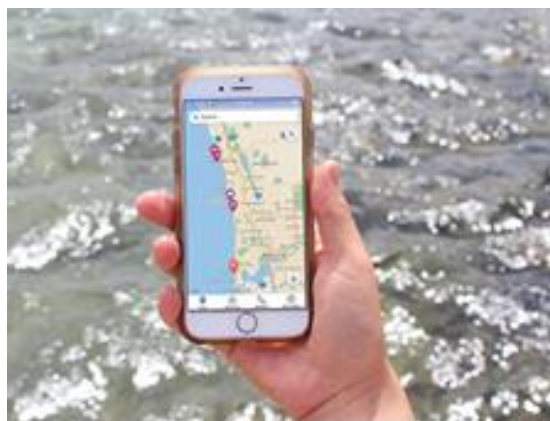
Figure 2 SharkSmart App