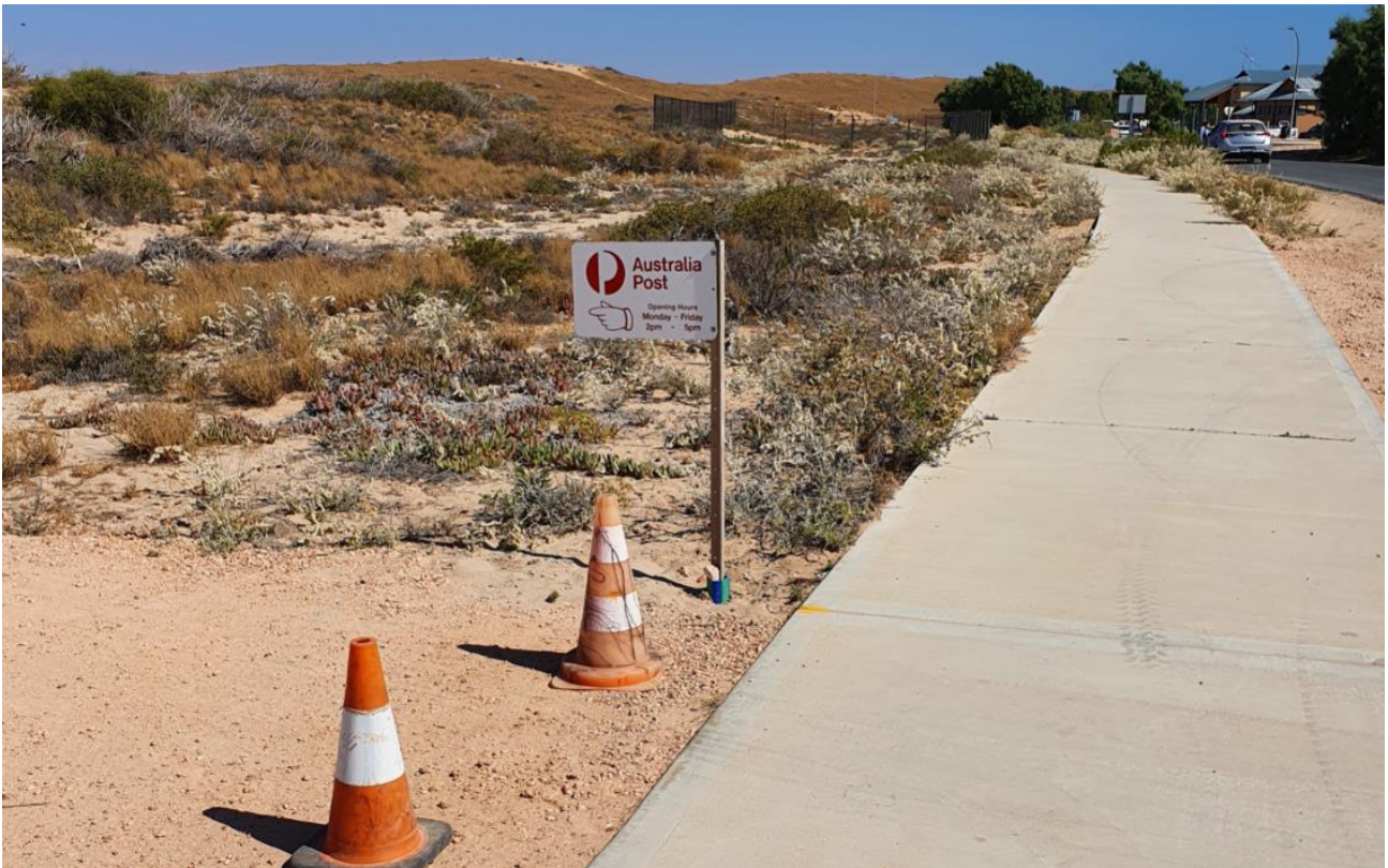
Figure 2: Proposed portable sign