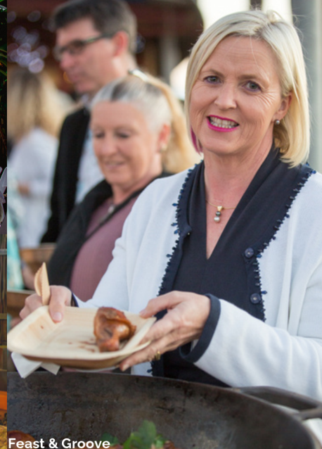
Long Table Lunch