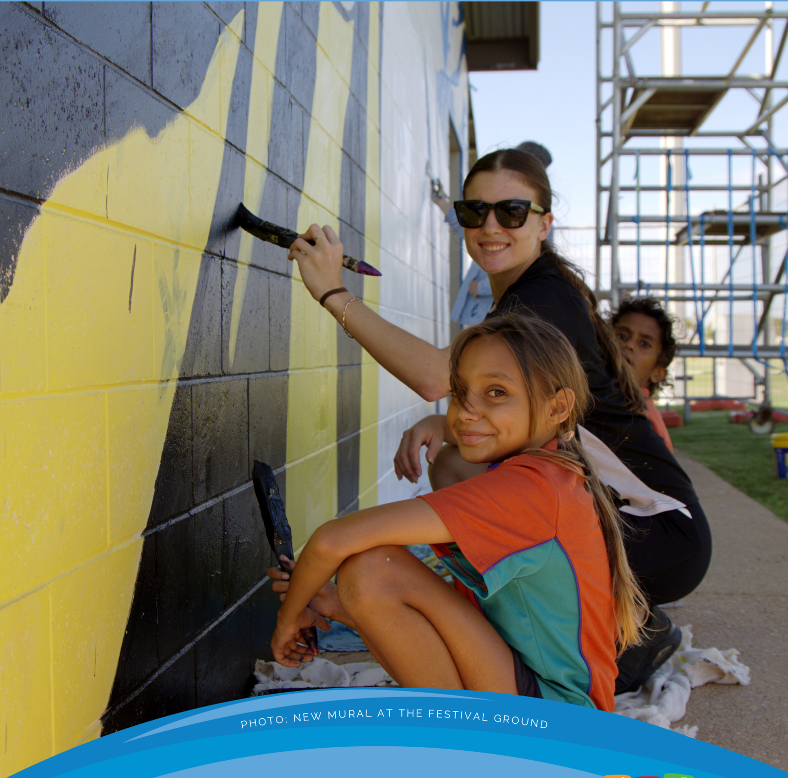
PHOTO: NEW MURAL AT THE FESTIVAL GROUND

CARNARVON & CORAL BAY COMMUNITY NEWSLETTER